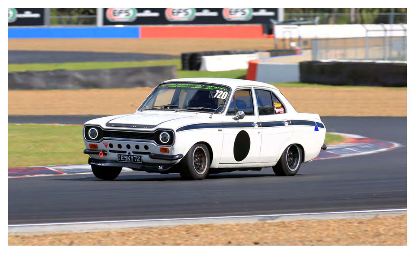
CLICK HERE FOR MORE GEAR PHOTOS