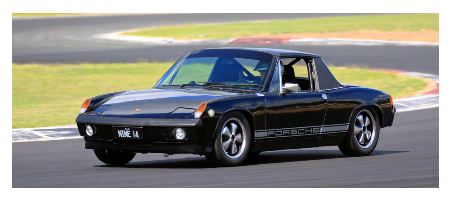
CLICK HERE FOR MORE GEAR PHOTOS