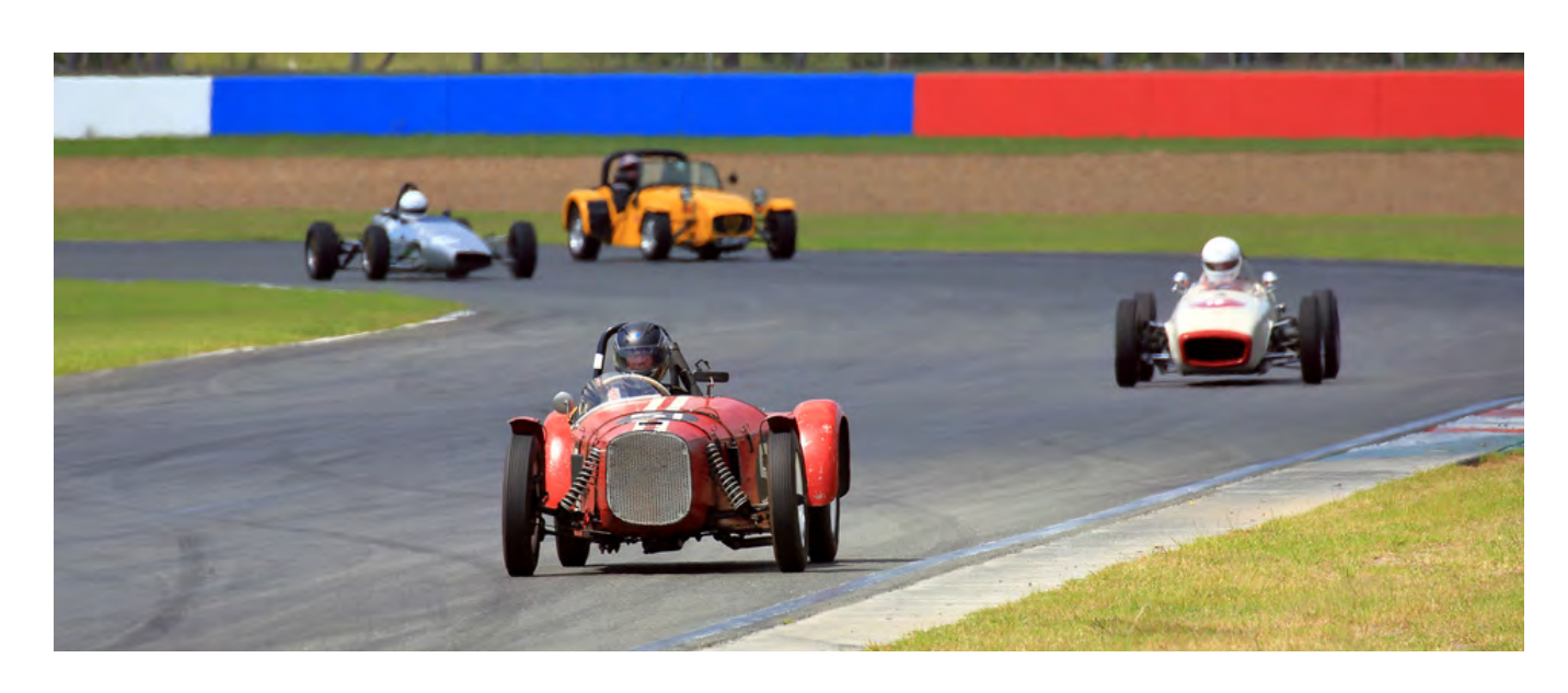
CLICK HERE FOR MORE GEAR PHOTOS