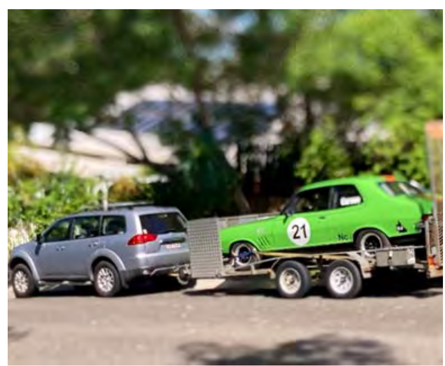
Torana - $65,000.00 Mitsubishi - $12,000.00 Trailer and spares - $8,000.00

Contact John Carson 0408 735 358 or email jaccarson50@gmail.com