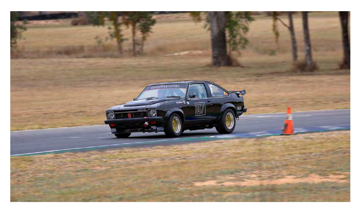
CLICK HERE FOR MORE GEAR PHOTOS