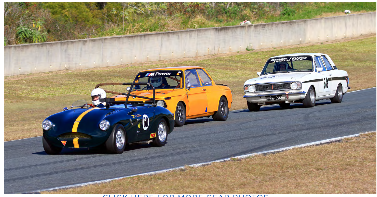
CLICK HERE FOR MORE GEAR PHOTOS