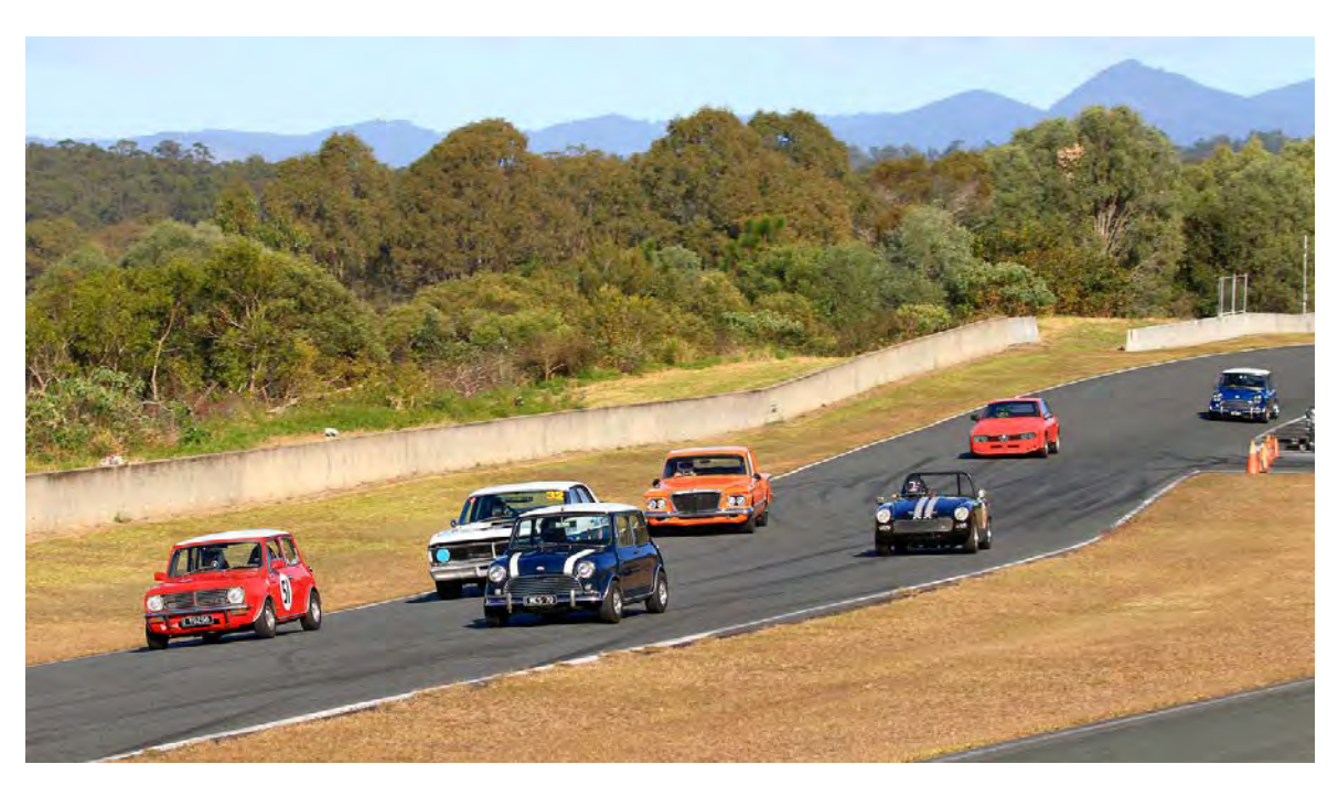
CLICK HERE FOR MORE GEAR PHOTOS